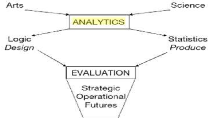
Fig: The Nature of Analytics Approach

first phase and use of Statistical tool second phase . Analytical is also explained as science of analytics derived from the Greek word “Analutika